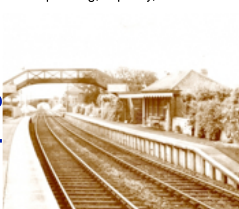
Hassendean of old, sporting its footbridge and charming station buildings. Everything but the tracks remain today.