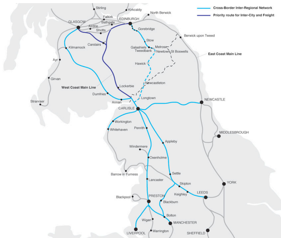
Diagram showing possible Cross-Border inter-regional network of through services, with a central hub at Carlisle.

Previous feasibility studies have taken a rather narrow focus when trying to assess the demand for extending the Borders railway to Hawick and Carlisle xii . A new study is urgently needed that takes a wider view, not only assessing the potential for local demand within the region, but also the demand for inter-regional travel (e.g. Edinburgh to Leeds, Manchester and Liverpool) which is currently being constrained by lack of capacity on existing routes.