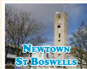
NEWTOWN ST BOSWELLS

Direct connections to the North West of England, Manchester Airport and London.